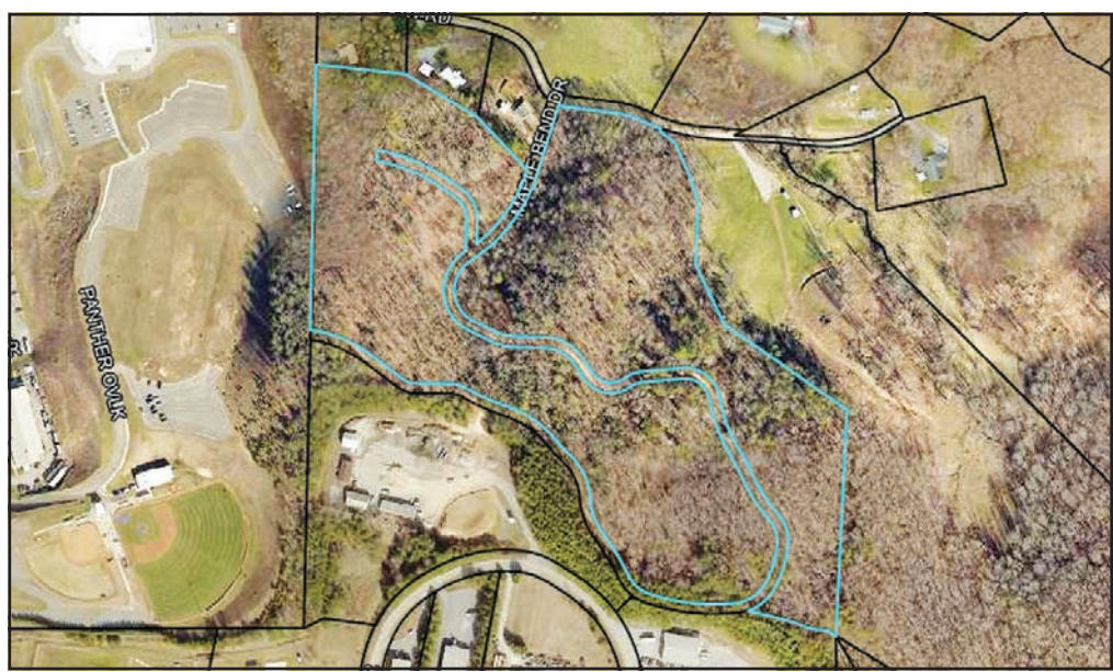
The Union County School System will be acquiring this roughly 32-acre land parcel next to the High School campus to build the new Elementary School.